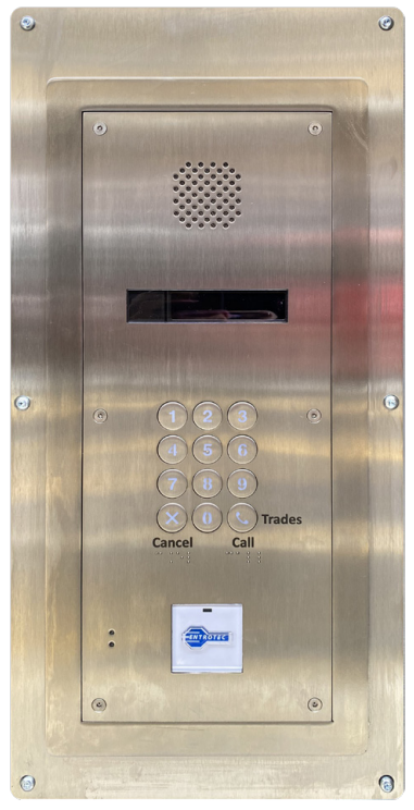
Stainless steel collar showing call panel installation (not supplied)

Surround for Type 17 and Type 23 entry panels