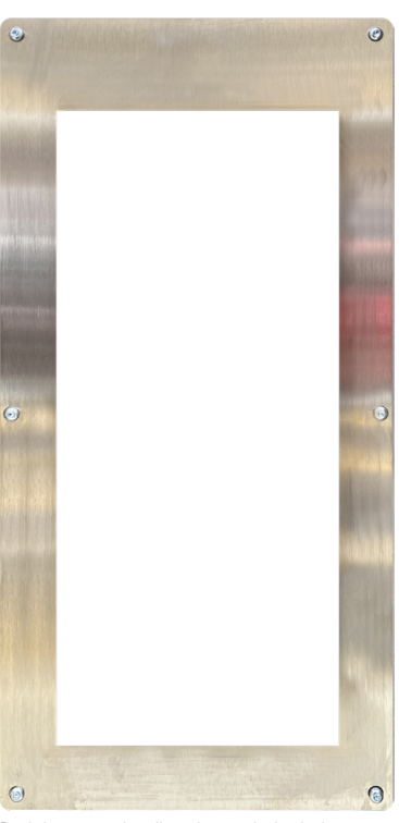
Stainless steel collar shown in isolation.