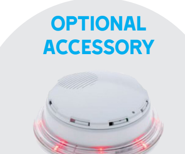
SOUNDER - 8 LED Sounder/Beacon Enhances Accessibility.

The ED4+ is compatible with APEX and ELITE systems and can be used with optional accessories that enhance accessibility; Sounder and Beacon.