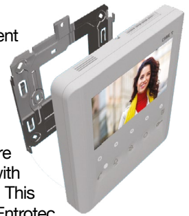
EV6 APARTMENT STATION ▲

What’s more, both handsets are fully backwards compatible with customers’ existing installations. This secures client investment in Entrotec systems for the long term.